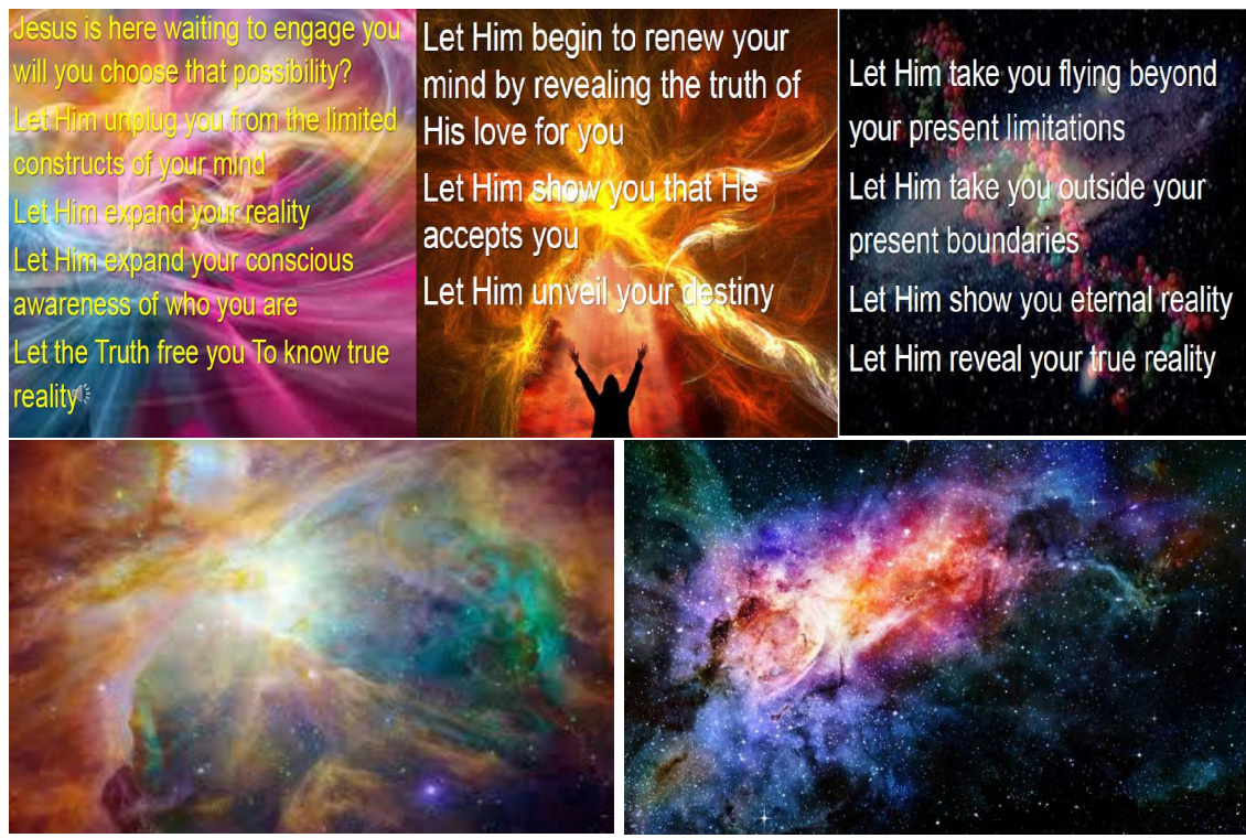
©2017 Freedom Apostolic Ministries Ltd. - <u>www.freedomtrust.org.uk</u> All rights reserved